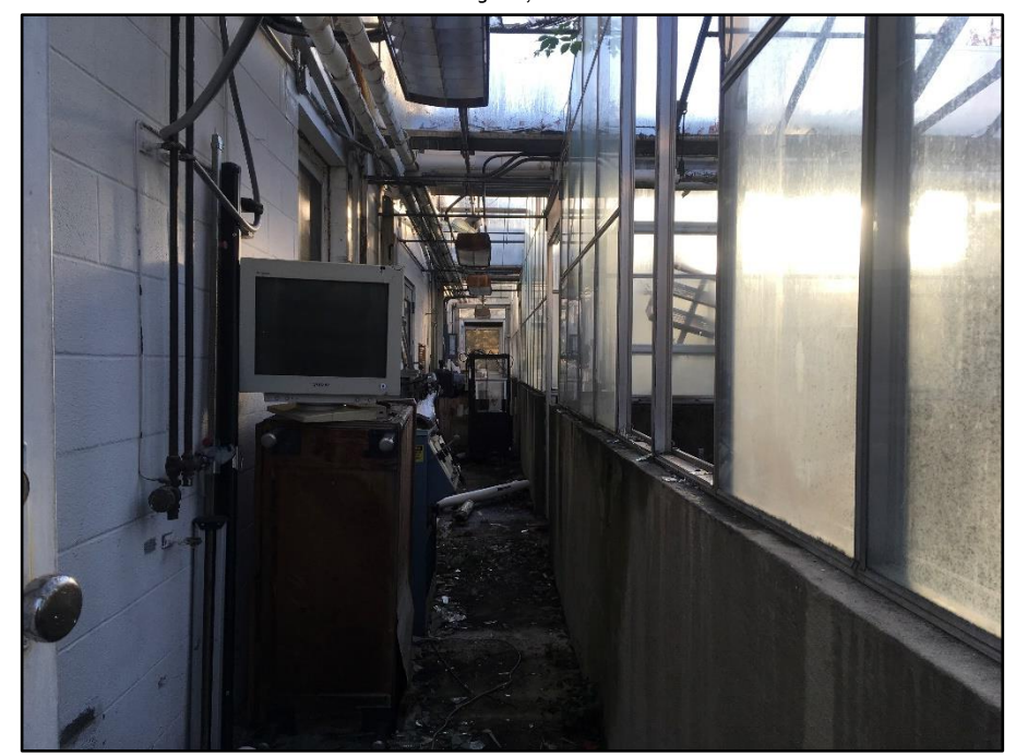
Photo 20: Building 465, inside of hall between main building and greenhouses