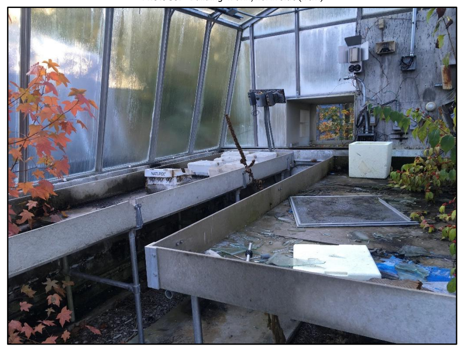
Photo 32: Buildings 470AA – 470JJ, representative photo of inside greenhouse