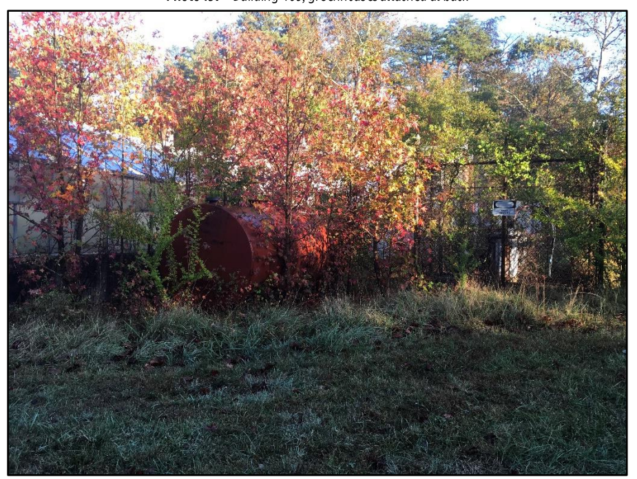
Photo 21: Building 465, large tank and electrical infrastructure, southwest side