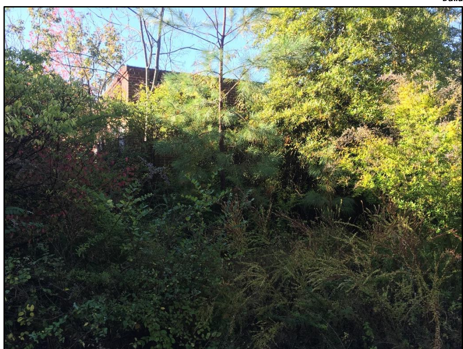
Photo 22: Building 470A, northeast corner, adjacent to Building 470