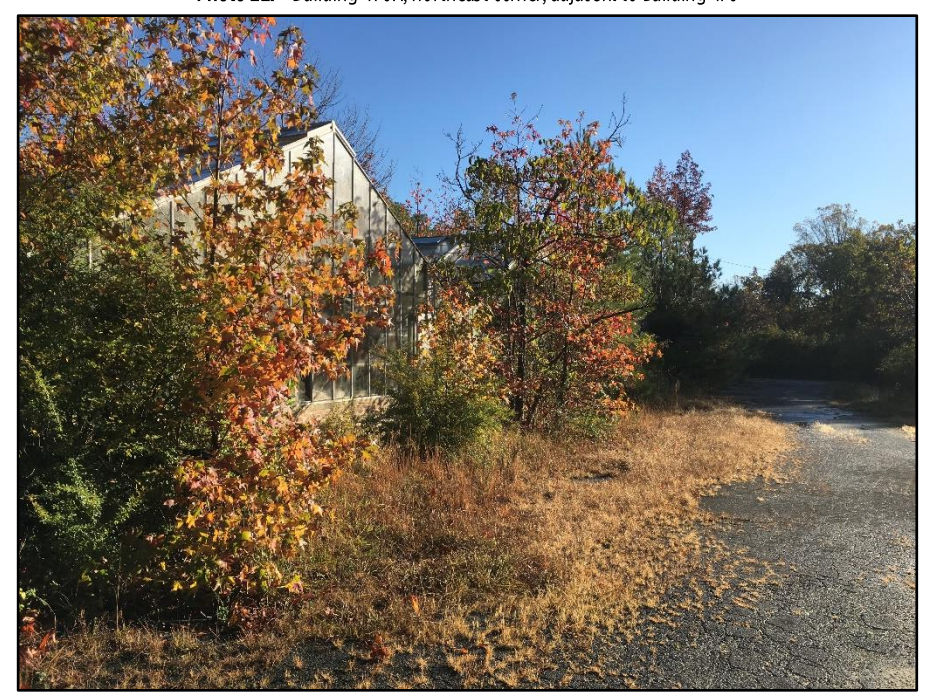
Photo 24: Building 470A, greenhouses attached at south side (back)