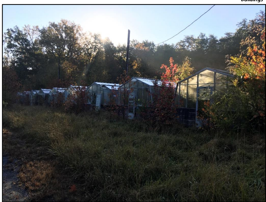
Photo 29: Buildings 470AA – 470JJ, north side (front) of greenhouses