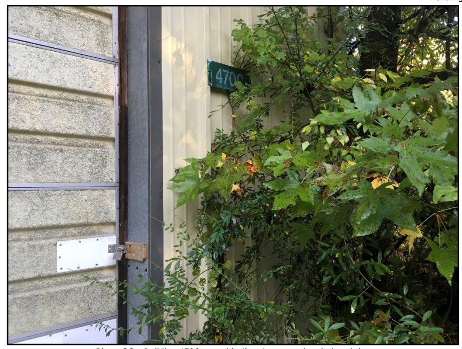
Photo 26: Building 470C, east side (front), garage door lock and sign